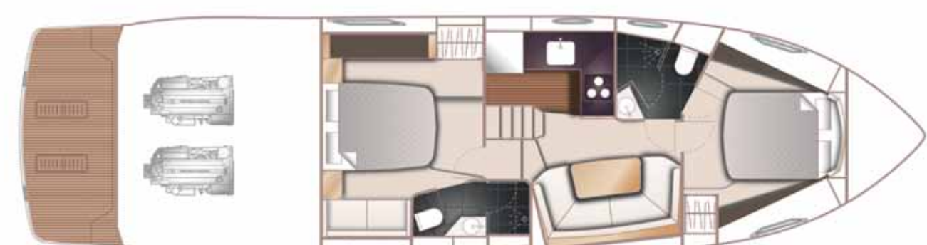
LOWER DECK - OPEN